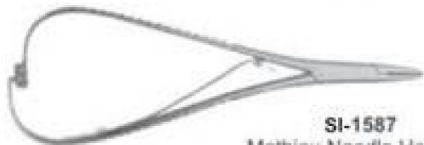
SI-1587 Mathieu Needle Holder, Narrow