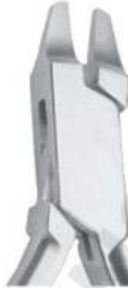
SI-1567 Rectangular Arch Formin Plier