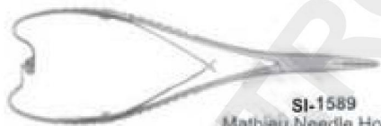
SI-1589 Mathieu Needle Holder, Double Bend, Small