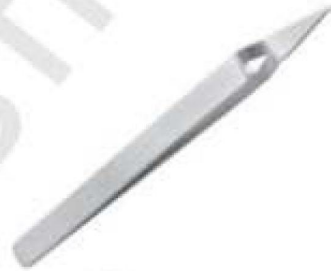
SI-1580 Direct Bond Bracket Holder