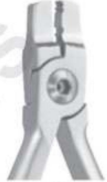
SI-1504 Lingual Arch Plier