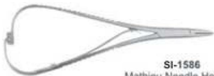
SI-1586 Mathieu Needle Holder, Wide