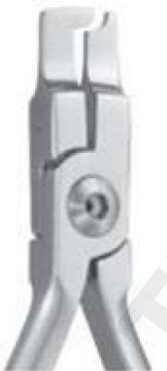
SI-1521 Band Crimping Plier