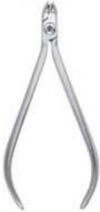
SI-1537 Mini Distal End Cutter, With Long Handle