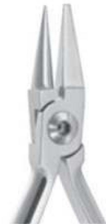
SI-1511 Light Wire Plier