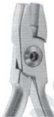
SI-1506 Arch Forming Plier, Without Grooves