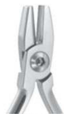
SI-1508 Hollow chop Arch Forming Plier