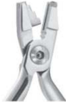
SI-1526 Loop Tie Back, Classic