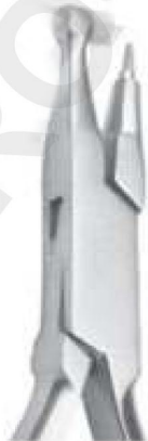
SI-1571 Adhesive Removing Plier