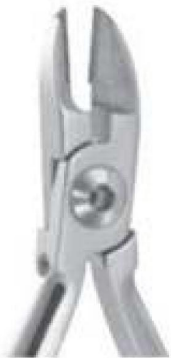
SI-1542 Mini-Pin and Ligature Cutter, 7 Degree