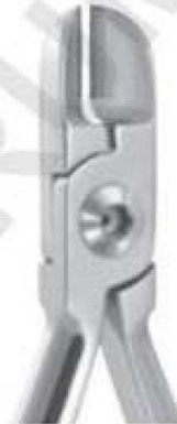
SI-1544 Hard Wire Cutter, Straight