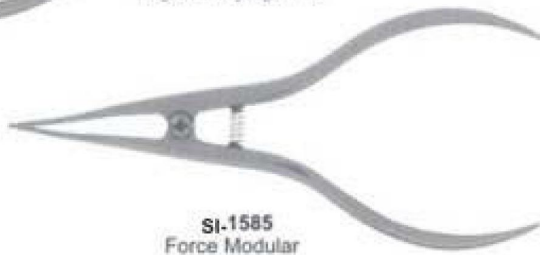
SI-1585 Force Modular Separator