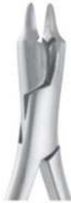
SI-ZO-1575 Universal Plier, Classic