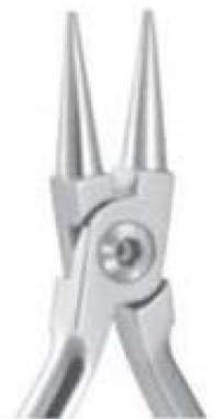
SI-1523 Round Nose Plier