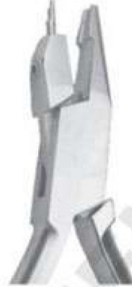
SI-1552 Loop Forming Plier Tweed Style