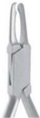
SI-1570 Reynolds Contouring Plier