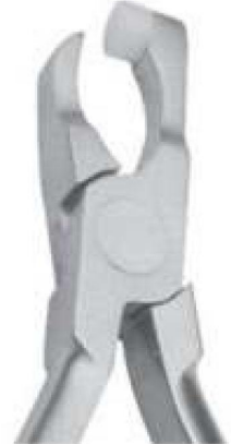
SI-1573 Posterior Band Removing Plier-short