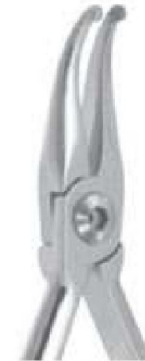
SI-1535 How Plier, Curved 45 Degree