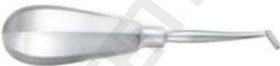
SI-1582 Band Pusher, Small