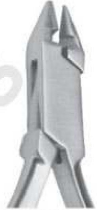
SI-ZO-1577 Standard Bird Beak With Cutter