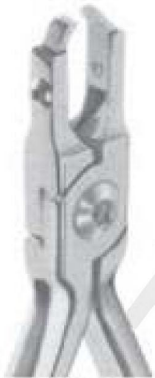
SI-1546 D.B. Bracket Removing Plier