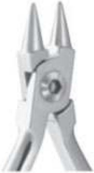
SI-1525 Double Round Jaw Plier