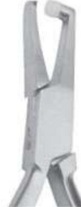
SI-1572 Posterior Band Removing Plier