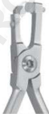
SI-1547 D.B. Bracket Removing Plier, with pad