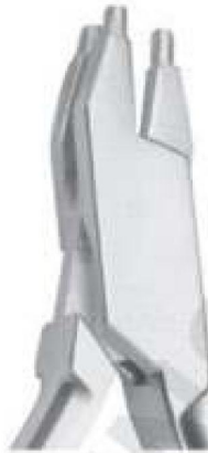
SI-1555 Three Jaws Round Plier (Öller)