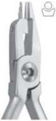
SI-1513 Loop Forming Plier, Tweed Style