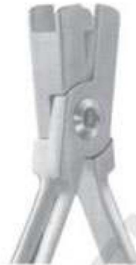
SI-1527 Torquing Plier, Wide