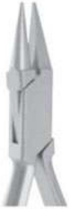
SI-ZO-1574 Spring Former / #65 plier