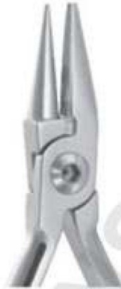
SI-1530 Round and Concave / Occulist Plier