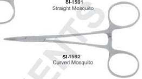
SI-1592 Curved Mosquito