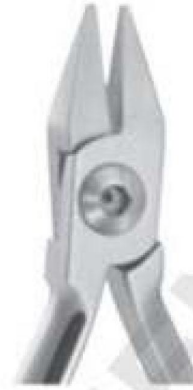
SI-1515 Adams Plier / Flat On Flat Plier