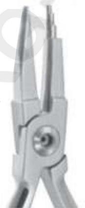
SI-1510 Tweed Loop Forming Plier (1 Piece)