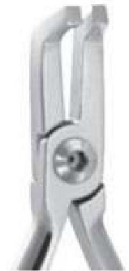
SI-1549 Direct Bond Bracket Removing Plier, Angled