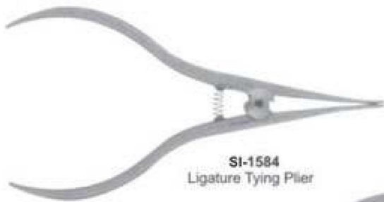
SI-1584 Ligature Tying Plier