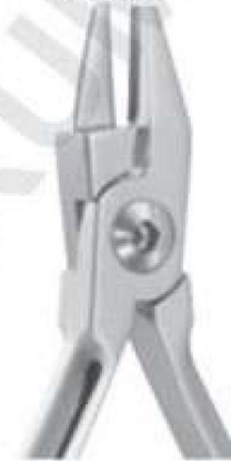
SI-1507 Three Jaw Plier, Aderer