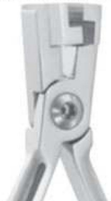
SI-1524 3mm Utility Plier