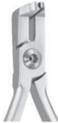
SI-1539 Distal End Cutter With Safety Hold