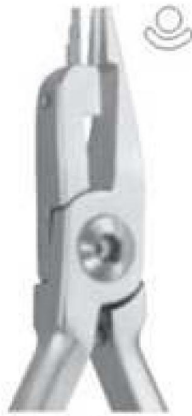
SI-1514 Omega Loop Forming Plier, Tweed Style