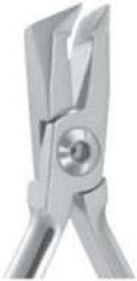
SI-1529 Cinch Back Plier