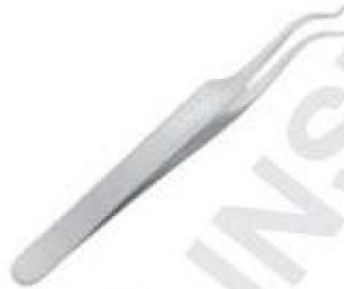
SI-1579 Easy Access Tweezer