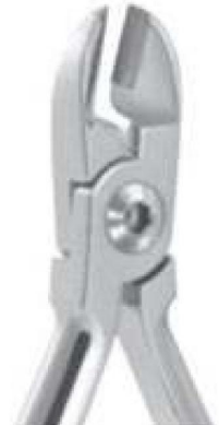
SI-1545 Hard Wire Cutter, 15 Degree