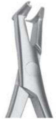
SI-1557 Niti Cinch Black Plier