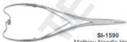
SI-1590 Mathieu Needle Holder, Double Bend, Large