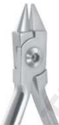
SI-1509 Bird Beak Plier