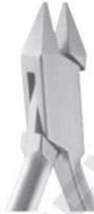
SI-ZO-1576 Adams Plier / #64 Laboratory Plier