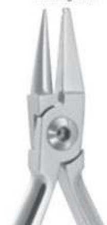
SI-1512 Light wire Plier With Groove