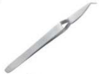
SI-1581 Bracket Placer