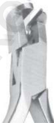
SI-1559 Flush Cut Distal End Cutler With Safety Hold