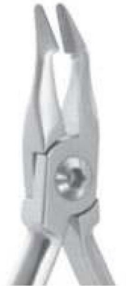
SI-1536 Utility Plier, Weingart