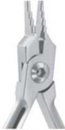
SI-1502 Loop Closing Plier, Nance Style