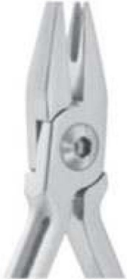
SI-1517 'V' Bend Stop Plier