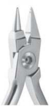
SI-1501 Light Wire Plier with short beaks / "Super-Looper"