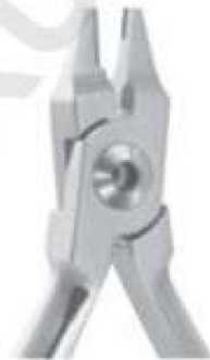
SI-1519 Hook Crimping Plier, Straight