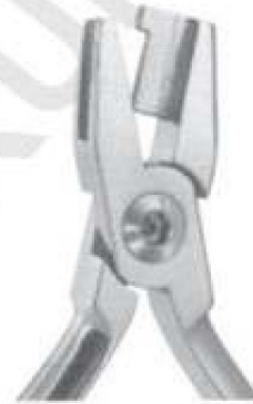
SI-1531 Ligature Forming Plier