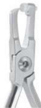
SI-1548 Posterior Band Removing Plier, long