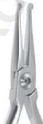
SI-1534 How Plier 3.2 mm