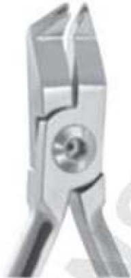
SI-1518 Hook Crimping Plier, Angled