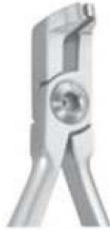
SI-1538 Mini - Distal End Cutter With Safety Hold