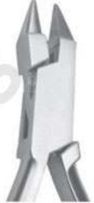
SI-1553 Serrated Bird Beak With