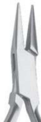
SI-1560 Model Marburg