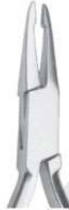
SI-1564 Standard How Utility Plier