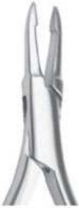
SI-1562 Standard How Utility Plier Rounded