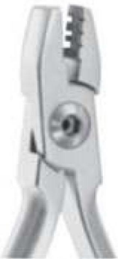
1505 Arch Forming and Contouring Plier