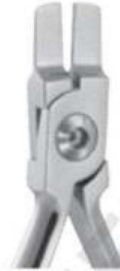
SI-1503 Rectangular Arch / Ribbon Arch Plier