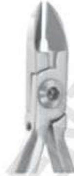
SI-1540 Mini-Pin and Ligature Cutter, Straight