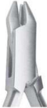
SI-1563 Aderer - Heavy