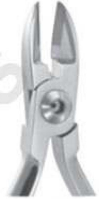
SI-1541 Pin and Ligature Cutter, Straight