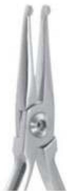
SI-1533 How Plier 2.4 mm