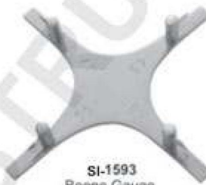
SI-1593 Boone Gauge Stainless Steel