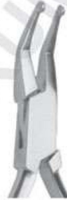
SI-1568 How - Angled