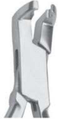
SI-1569 Angled Bracket Removing Plier