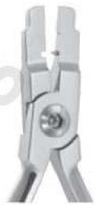
SI-1516 Utility Arch Plier