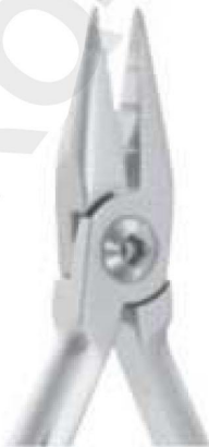
SI-1522 Jarabak Plier