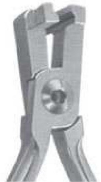
SI-1520 Detailing Step Plier Available All Size 1-mm 1/2-mm 3/4-mm 1/4-mm