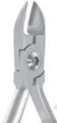
SI-1543 Pin and Ligature Cutter, 15, Degree