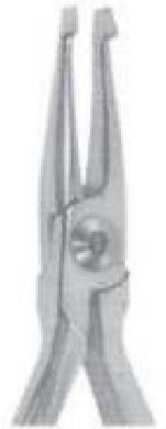
SI-1532 Band Seating Plier